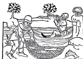
Fisheries were extremely important in the medieval fens. In 1086 Swaffham Bulbeck owed 100 eels to its lord; Bottisham owed 400.

fish and wildfowl in winter when water levels rose. With grain and heath pasture for sheep on the chalk uplands, the fen edge villages grew prosperous.